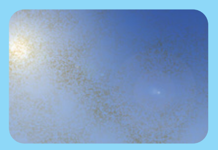
1. The window is exposed to daylight.