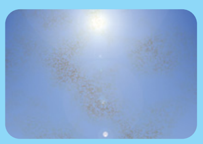
2. Daylight triggers the Pilkington \mathbf{Activ}^{\scriptscriptstyle \mathsf{TV}} coating.