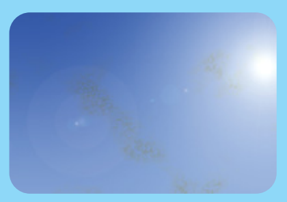
3. Reaction loosens organic dirt.